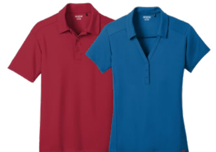
OGIO® FRAMEWORK POLOS 4.2-ounce, 100% polyester pique OG125 | XS-4XL | 4 colors LOG125 | Women's XS-4XL | 4 colors