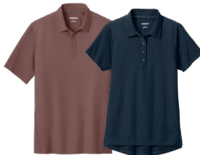
OGIO® ENVISION POLOS 4.9-ounce, 88/12 nylon/spandex micropique with stay-cool wicking technology OG154 | XS-4XL | 6 colors LOG154 | Women's XS-4XL | 5 colors