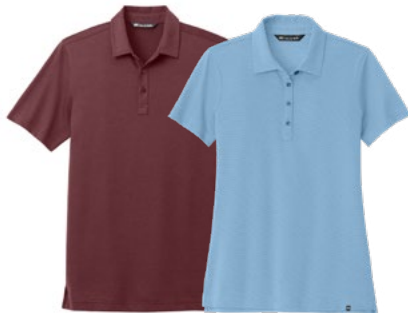
TRAVISMATHEW SUNNYVALE POLOS 5-ounce, 64/36 pima cotton/polyester TM1MAA369 | S-3XL | 6 colors TM1LD005 | Women's S-2XL | 5 colors