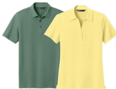
TRAVISMATHEW GLENVIEW SOLID POLOS 4.1-ounce, 74/19/7 recycled polyester/cotton/spandex TMA41461 | S-3XL | 7 colors TM1LF071 | Women's S-2XL | 5 colors