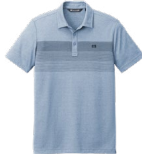
TRAVISMATHEW COASTAL CHEST STRIPE POLO 4.4-ounce, 58/42 cotton/polyester TM1MY402 | S-3XL | 4 colors