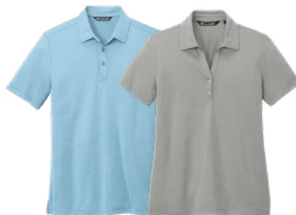
TRAVISMATHEW COTO PERFORMANCE POLOS 4.1-ounce, 100% polyester TM1MU410 | S-3XL | 9 colors TM1WX002 | Women's S-2XL | 5 colors