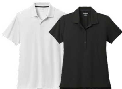
OGIO® REGAIN POLOS 5-ounce, 88/12 recycled poly/recycled spandex OG170 | XS-4XL | 8 colors LOG170 | Women's XS-4XL | 6 colors