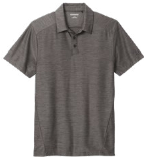
OGIO® SLATE POLO 5.2-ounce, 90/10 polyester/spandex OG143 | XS-4XL | 3 colors