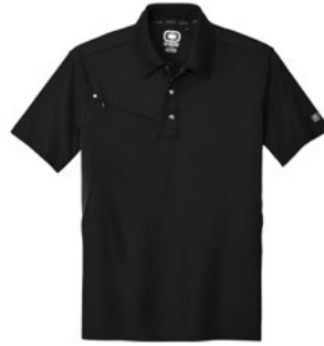
OGIO® ACCELERATOR POLO 5-ounce, 100% polyester pique OG102 | XS-4XL | 3 colors