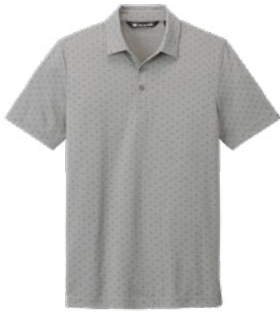
TRAVISMATHEW OCEANSIDE GEO POLO 4.4-ounce, 58/42 cotton/polyester TM1MY403 | S-3XL | 2 colors