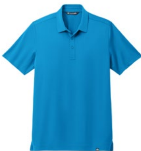
TRAVISMATHEW CABANA SOLID POLO 4.1-ounce, 96/4 recycled polyester/spandex TM1MAA370 | S-3XL | 7 colors