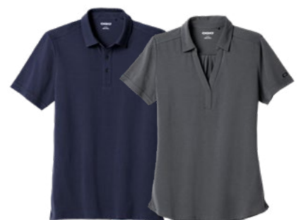
OGIO® LIMIT POLOS 5.6-ounce, 58/38/4 cotton/polyester/spandex OG138 | XS-4XL | 6 colors LOG138 | Women's XS-4XL | 6 colors