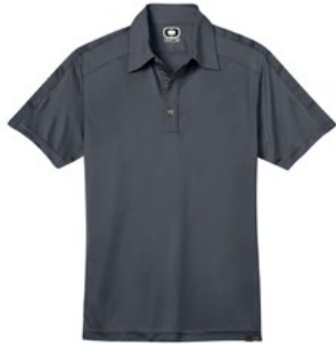
OGIO® HYBRID POLO 4.9-ounce, 100% polyester OG109 | XS-4XL | 3 colors