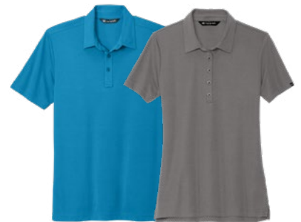
TRAVISMATHEW OCEANSIDE SOLID POLOS 4.6-ounce, 51/49 cotton/polyester TM1MU411 | S-3XL | 6 colors TM1WW001 | Women's S-2XL | 5 colors