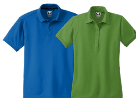
OGIO® CALIBER2.0 POLO 5-ounce, 100% polyester pique OG101 | XS-4XL | 13 colors