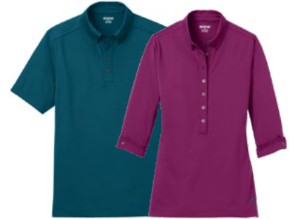
OGIO® GAUGE POLOS 5.9-ounce, 94/6 polyester/spandex OG122 | XS-4XL | 5 colors LOG122 | Women's XS-4XL | 6 colors