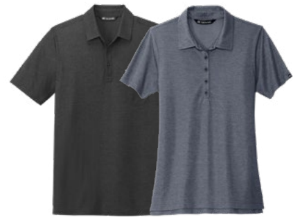
TRAVISMATHEW OCEANSIDE HEATHER POLOS 4.4-ounce, 57/43 cotton/polyester 4.1-ounce, 57/43 cotton/polyester (Women's) TM1MY404 | S-3XL | 3 colors TM1WW002 | Women's S-2XL | 6 colors