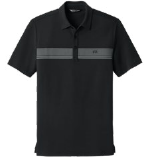
TRAVISMATHEW GLENVIEW STRIPE POLO 4.1-ounce, 74/19/7 recycled polyester/cotton/spandex TMA41462 | S-3XL | 4 colors